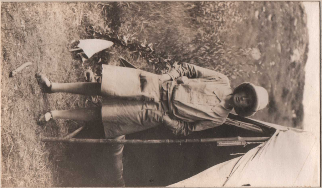
My camp. Huske.