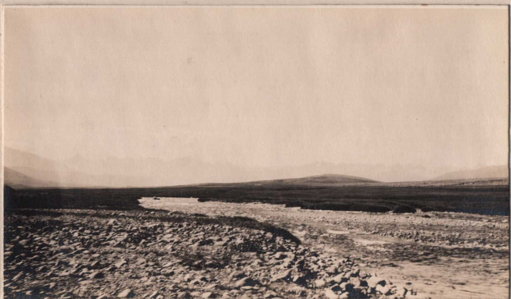
Deosai Plateau - 13,000 to 14,000 ft.