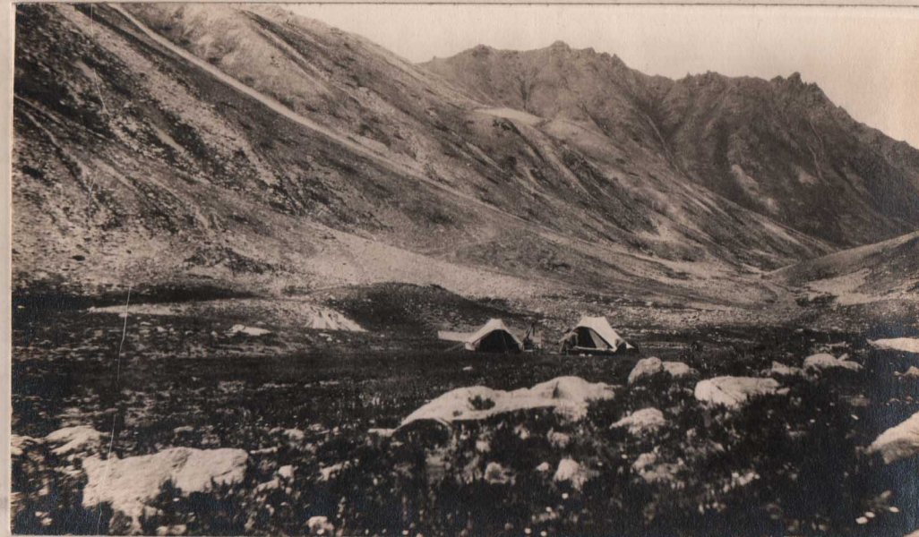
Camp, Chota Deosai.