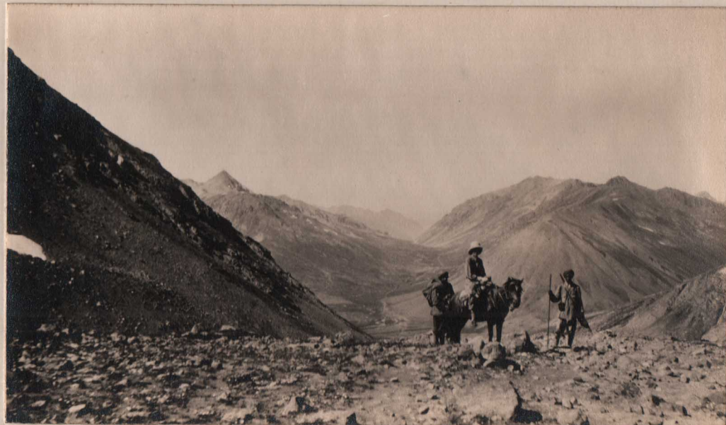
Sam Saeri Pass. 14,200 ft., to Deosai Plateau.