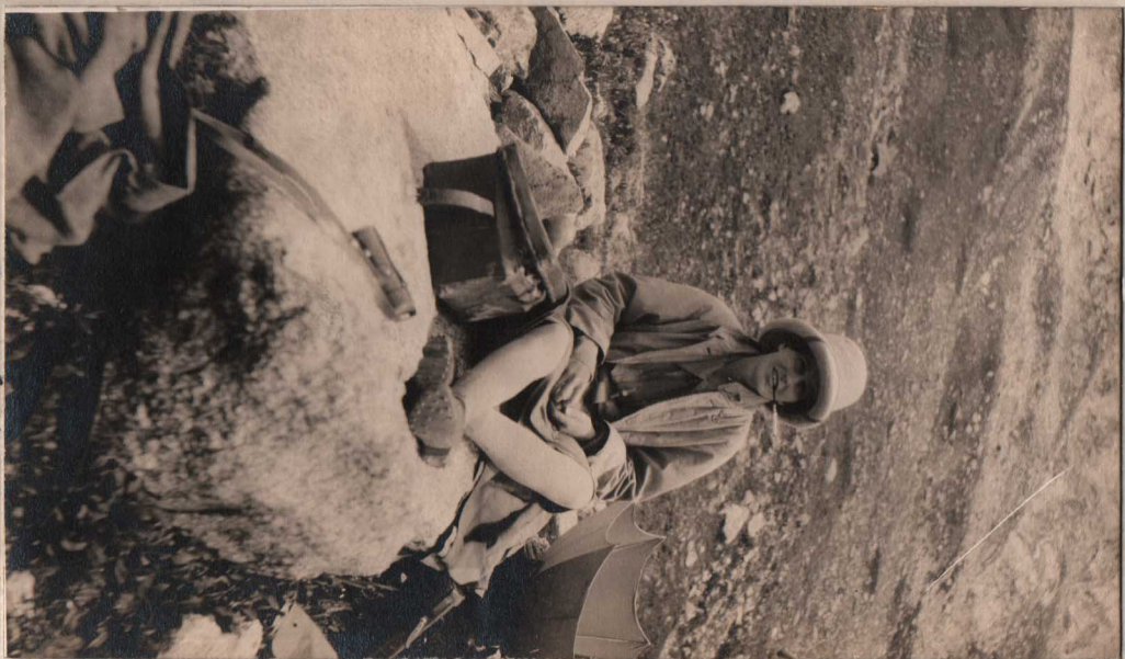
Burgil, Chota Deosai.