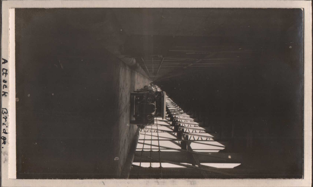
A. C. Beck Bridge