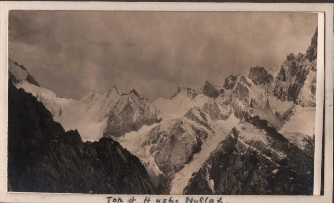
Top of Hushe Nullak.