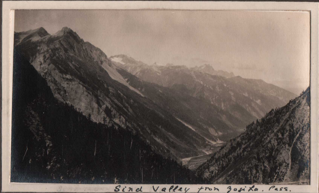
Sind Valley from Gosika Pass.