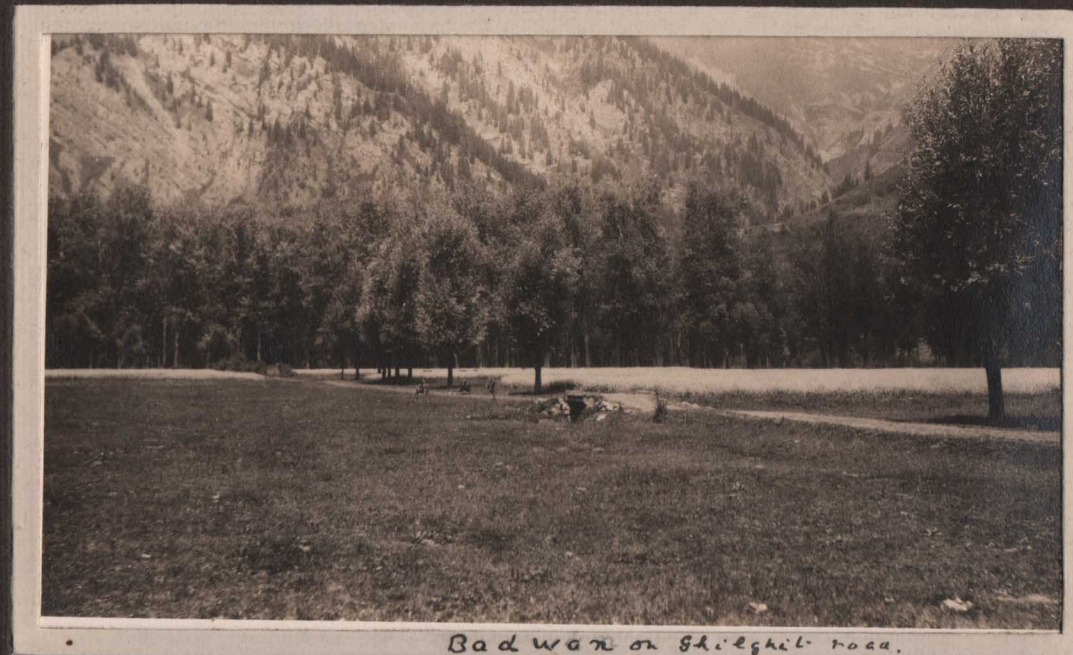
Badwan on Shitghit road.