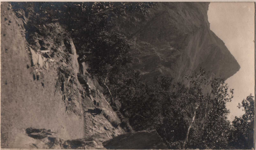
3080 KA PASS. 11,500 FT.