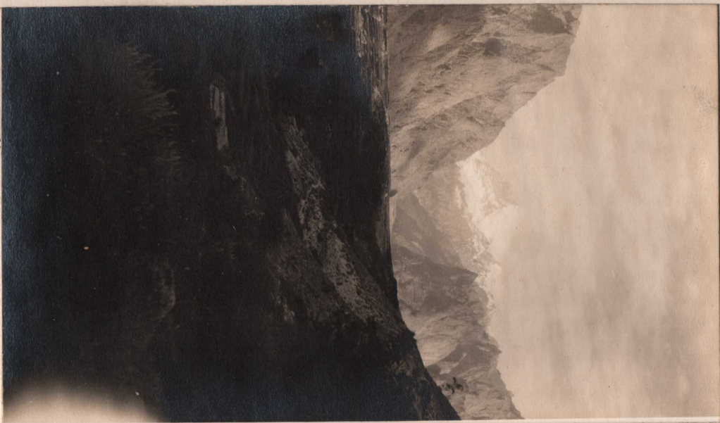
Huske Valley + Muskeg-Grassy.