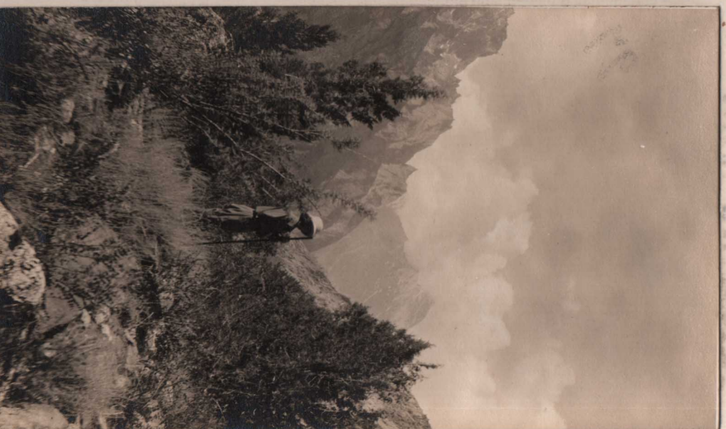
View of Miesheki from Yashu Hangon Nutsal