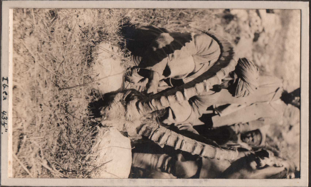
Iber 43 1/2"