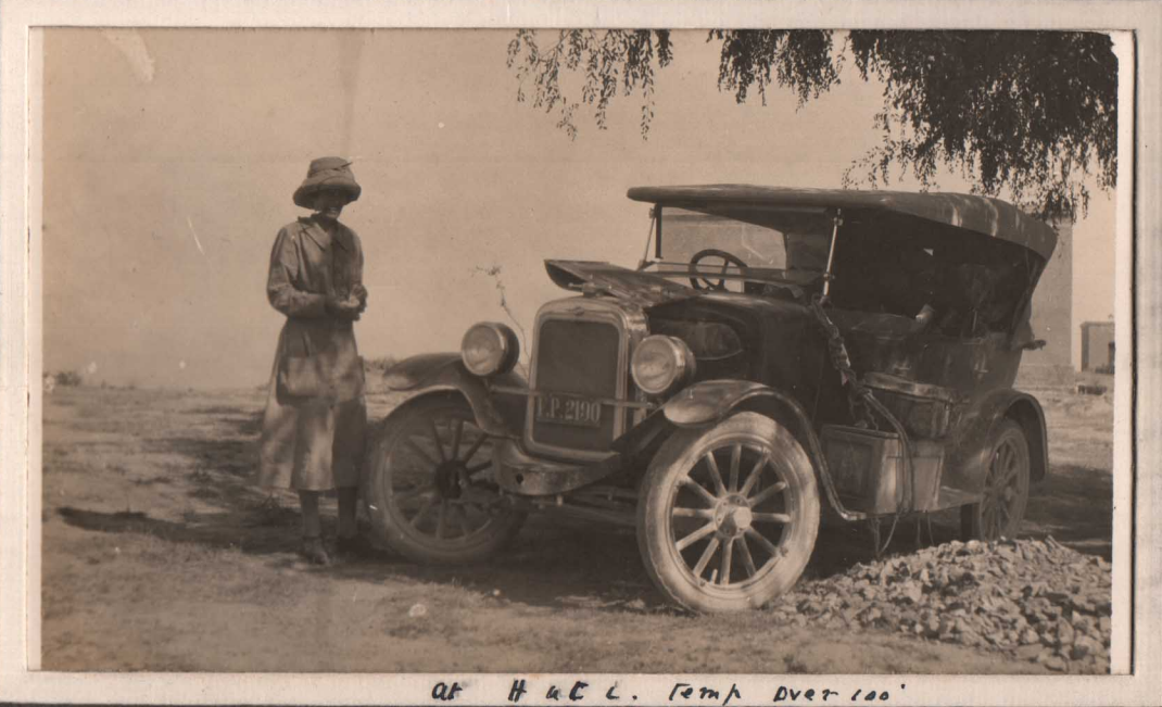
at H & C L. Temp over 100'