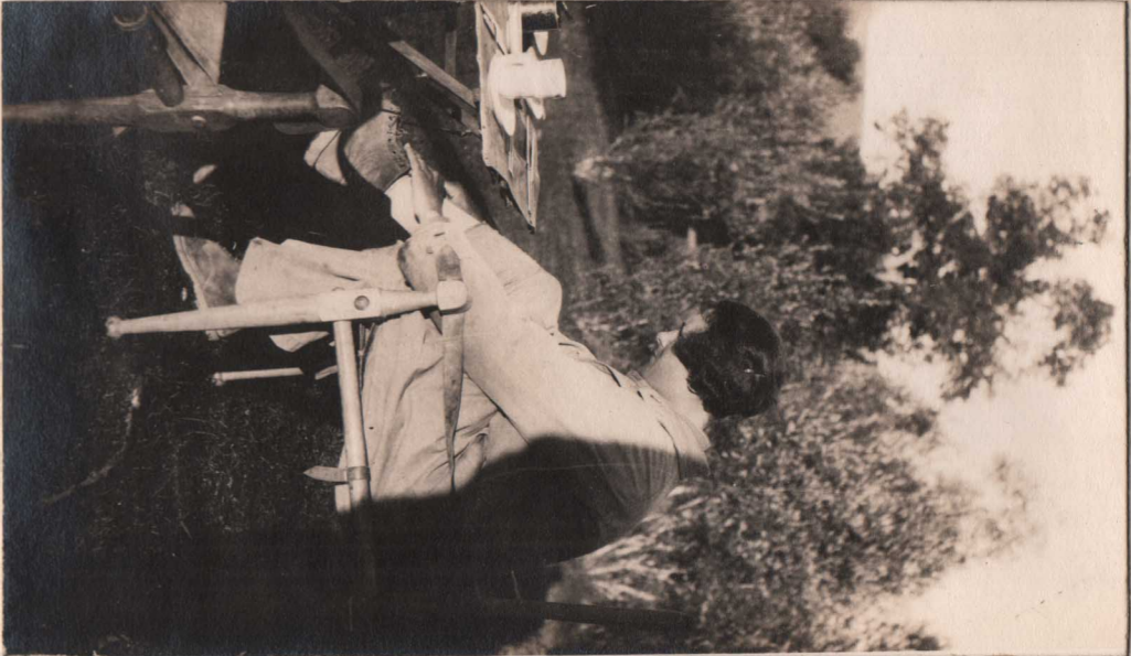
DTOS LADHAK TOSAL.