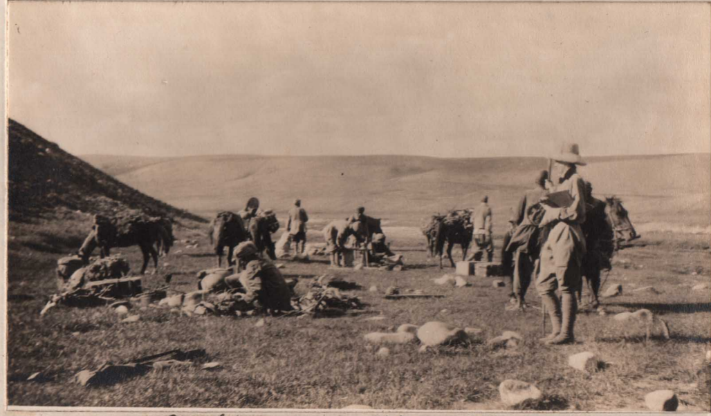
Pitching camp, after 20 mile march.