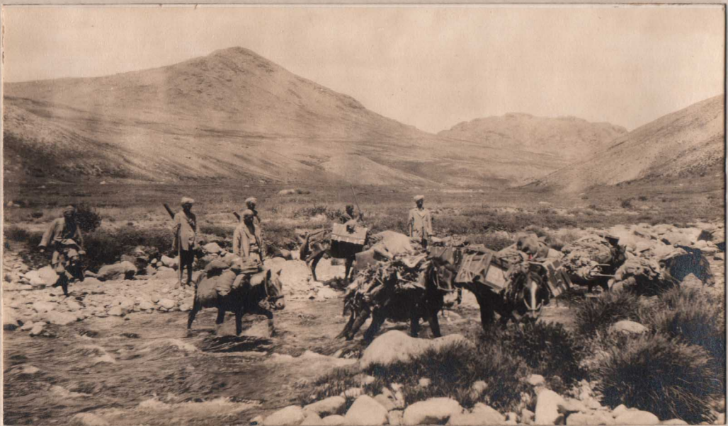
Baggage ponies crossing river on Deosai.